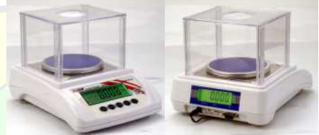
EJB-FRH 600 (600 g x 0.005g) with Front & Rear LCD display

ENDEL will now be able to provide many new models for Jewellery Scales' Market in coming months. However, ENDEL has already launched its new model EJB-FRH in Jan., 2007.